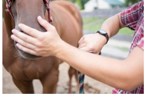
Figure 4. You can measure an animal's respiration rate by observing breaths at the nostrils.