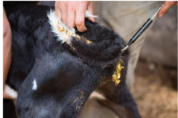
Figure 1. You may opt to use a digital temperature.